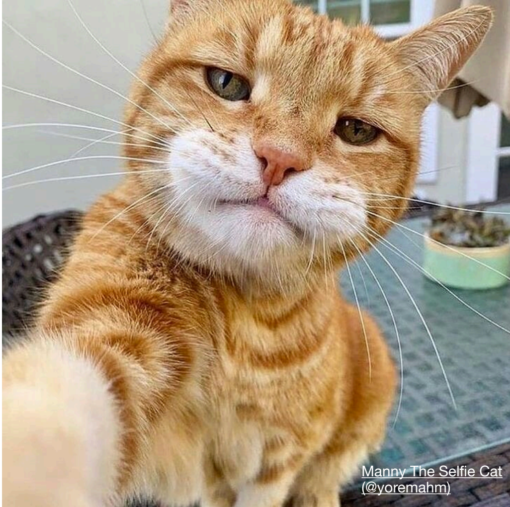
Manny The Selfie Cat

The purpose of choosing a selfie or a photographer shot is to empower participants to gain control of their own “self”, by opening a dialogue with themselves through photography in the shooting, and choosing the photo for himself/herself.